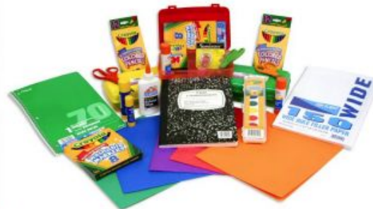
Image is a representation of supplies; not exact items your child will need.

Our school will be offering families an opportunity to purchase school supply kits for the upcoming school year. The kit contains all the supplies requested by the Kindergarten teacher(s). Kits will be delivered to school in August.